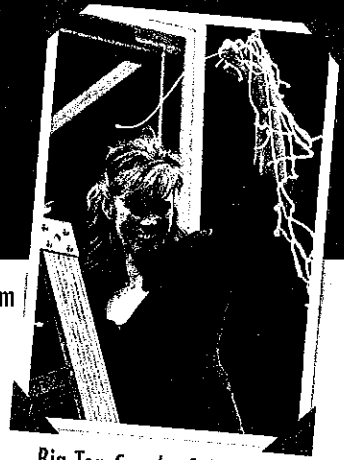
Big Ten Coach of the Year